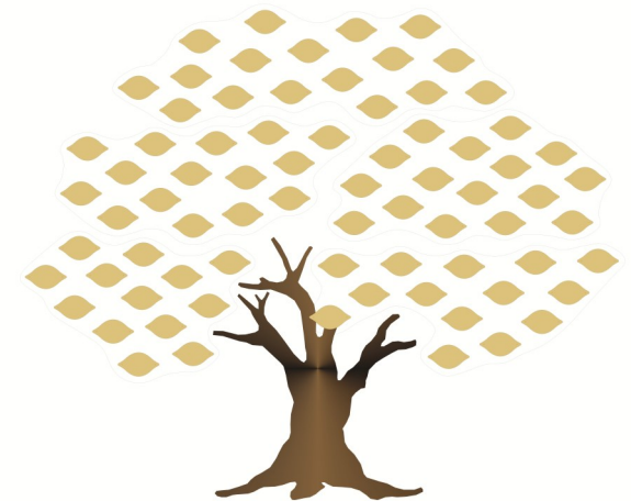
The Keene Y Giving Tree to honor Legacy Donors